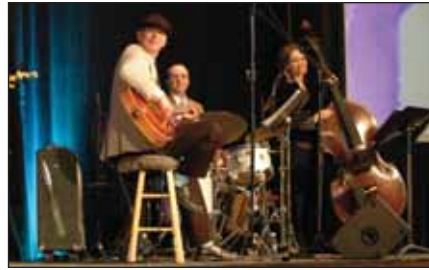
The Willie August Project kept the evening light and jazzy—and moving along.