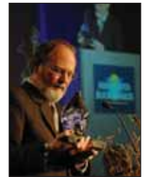
Winning mystery writer William Kent Krueger hefted the award and noted that it could be a "blunt instrument."