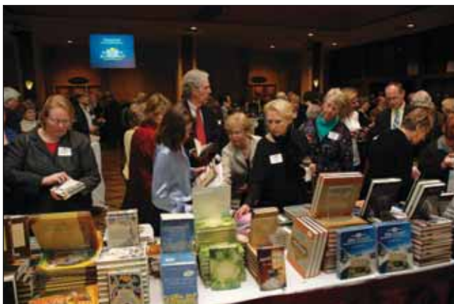
A big piece of the Minnesota Book Awards' success is the sale and signing of all finalist book titles at the pre-gala reception.

Eight category awards (see inset at right) and three special awards were presented