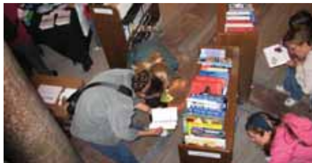
Guests selected a free book of their choice, donated by the Timberwolves, Barnes @ Noble Booksellers, and The Friends.