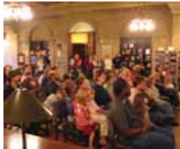
The Raptor Center held the audience in rapt attention as they presented birds of prey in all sizes ranging from American kestrels to eagles.