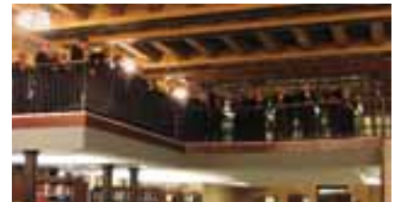
It seemed something like heaven must sound when the Kantorei Chamber Choir filled the upper level of Nicholson Commons. The 40-member choral ensemble performed work focusing on 19th and 20th-century European music.