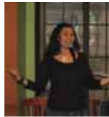
Local treasures and Latina poetry super-group, Palabristas! showed the human side of being an immigrant in Minnesota.