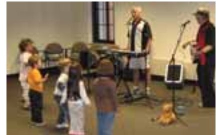
The Teddy Bear Band’s littlest fans danced.