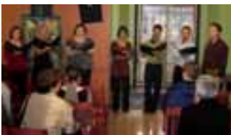
Mixed vocal ensemble, Deviated Septet, sang in amazing 7-part harmony, despite having their tongues planted firmly in cheek, at Central Library’s Zelda Coffee.